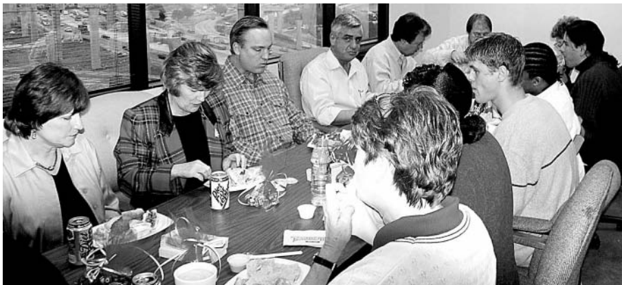
To celebrate the holiday season, the Dallas staff gathered for a festive lunch and a white elephant gift exchange.