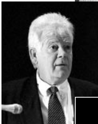
Rep. Jim McDermott (D-Wash.)

“There are about 44 million Americans who lack health insurance in any year. The time has come to work together on a refundable tax-credit to purchase health insurance.” That was the bipartisan message from Rep. Nancy Johnson (R-Conn.), the chairwoman of the House Ways & Means Health Subcommittee, and her fellow subcommittee member Rep. Jim McDermott (D-Wash.) as they addressed a Capitol Hill briefing on the competing visions for creating a health care tax credit hosted by the NCPA and the American Medical Association (AMA).