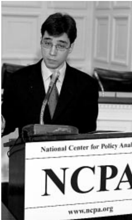
Dr. David Gratzer, a Canadian physician and author of the book "Code Blue," exposes the hard facts about Canadian health care during a recent NCPA briefing on Capitol Hill.

With members of Congress, state legislators and health policy experts debating the merits of Canadian government-run health care and its price-controlled prescription drug system, the NCPA presented a Capitol Hill briefing in May to expose the hard facts about Canadian health care.